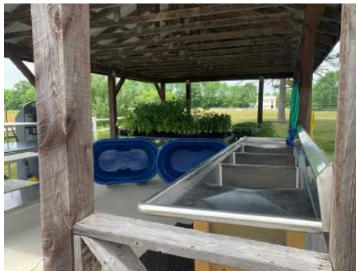
Pictured clockwise from top left: Fields planted; Anthony House (or "The Farmhouse") viewed from Gloucester Hill Rd; dedicated wash station for harvested produce